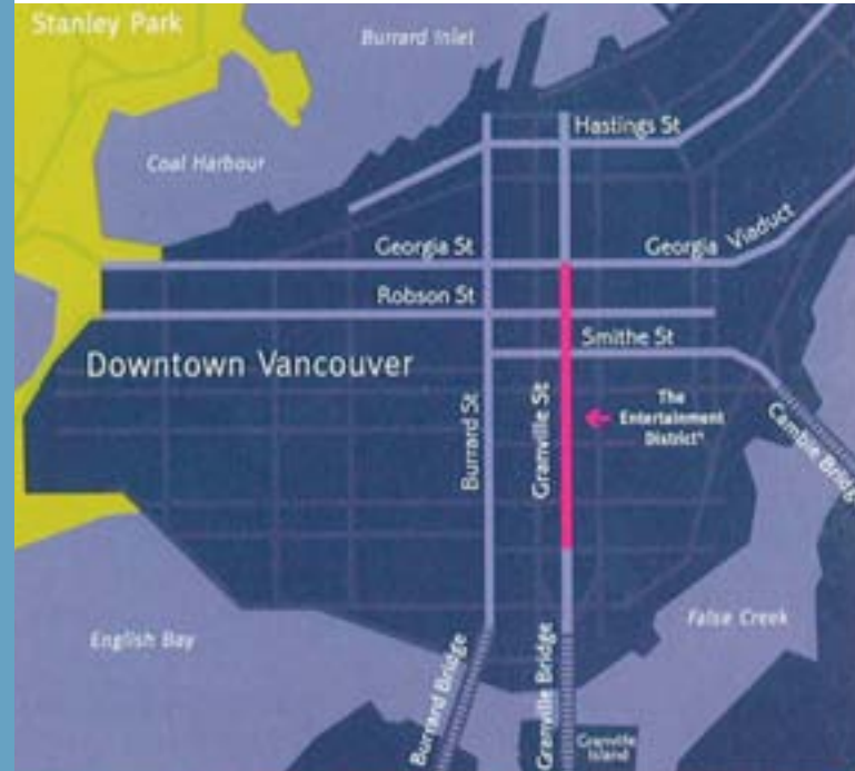
See inside of brochure for a more detailed map of The Entertainment District.