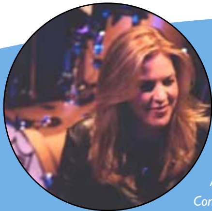
Left: Jazz icon Diana Krall at the Chan Centre for Performing Arts during the 2003 North American Leadership Conference in Vancouver

Each year, select pediatric specialists present the real-life stories of the children who benefit from your generosity, allowing you to hear first hand about the inspiring work of the doctors who save the lives of children everyday - and how your gifts make this possible through advancements made in pediatric care, research and education.