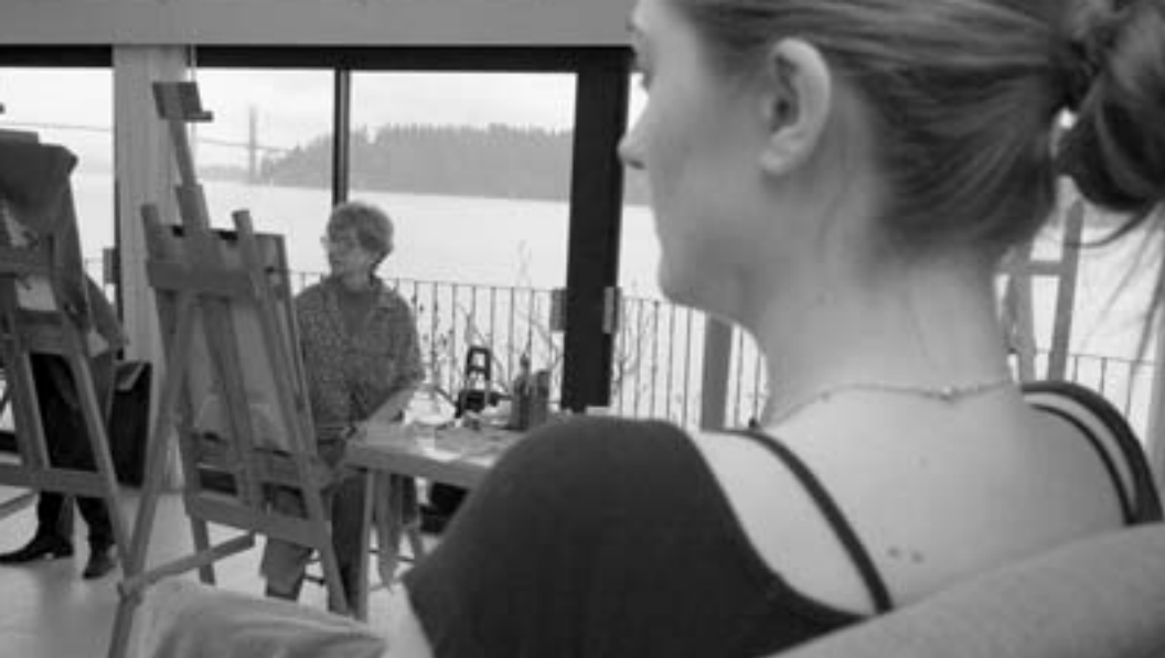
Portrait painting/drawing at the Music Box on Argyle.